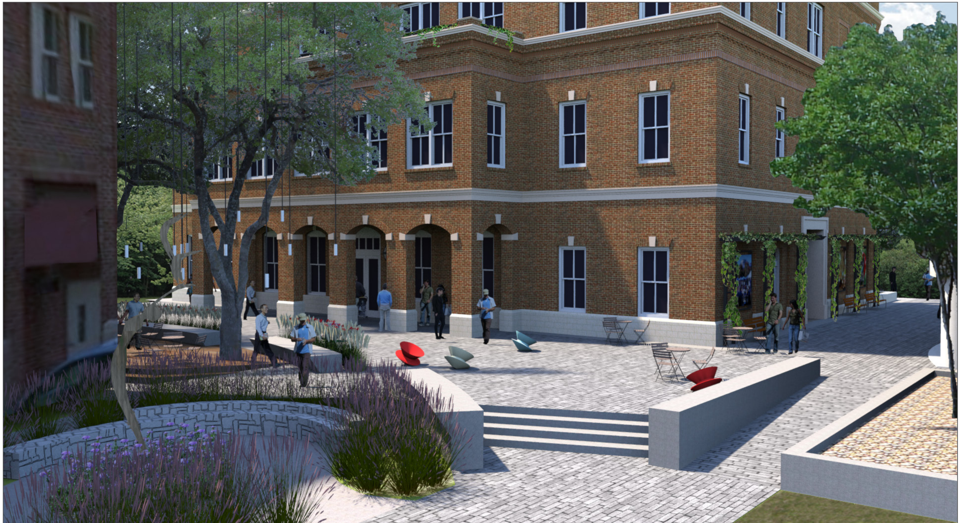
VIEW ALONG PEDESTRIAN PATHWAY