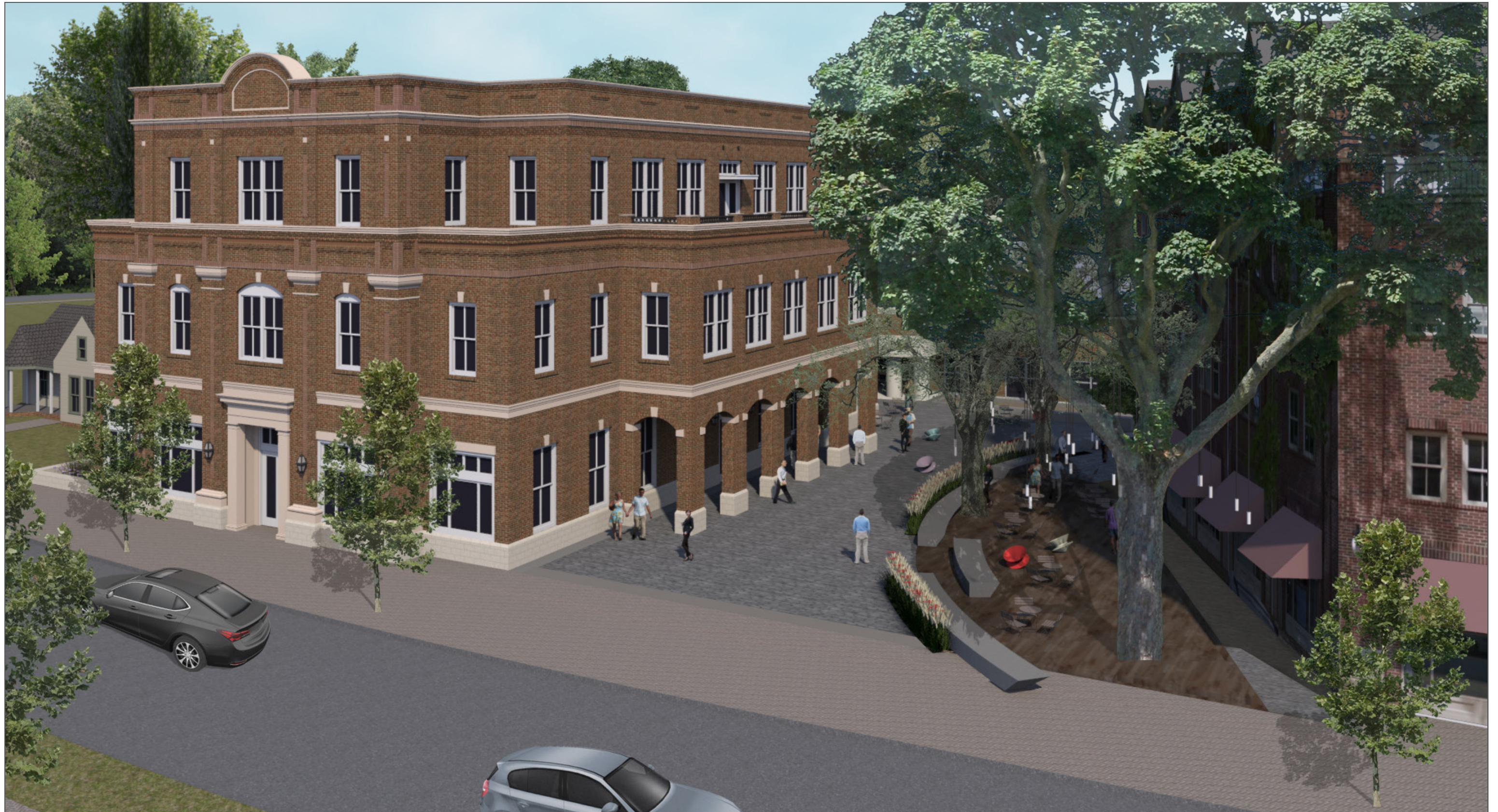
VIEW SOUTH FROM S. MAIN STREET INTO PLAZA