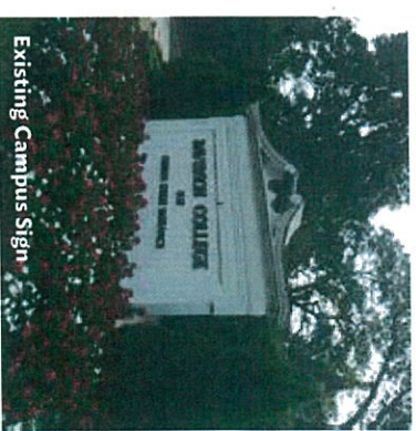
Existing Campus Sign