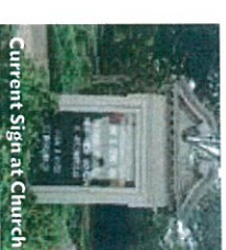
Current Sign at Church