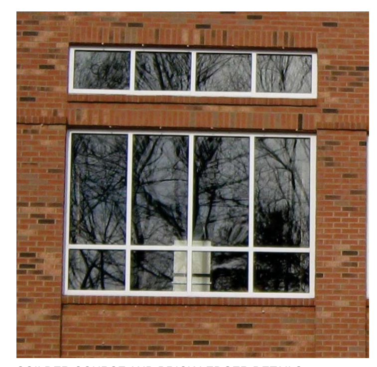
SOILDER COURSE AND BRICK LEDGER DETAILS