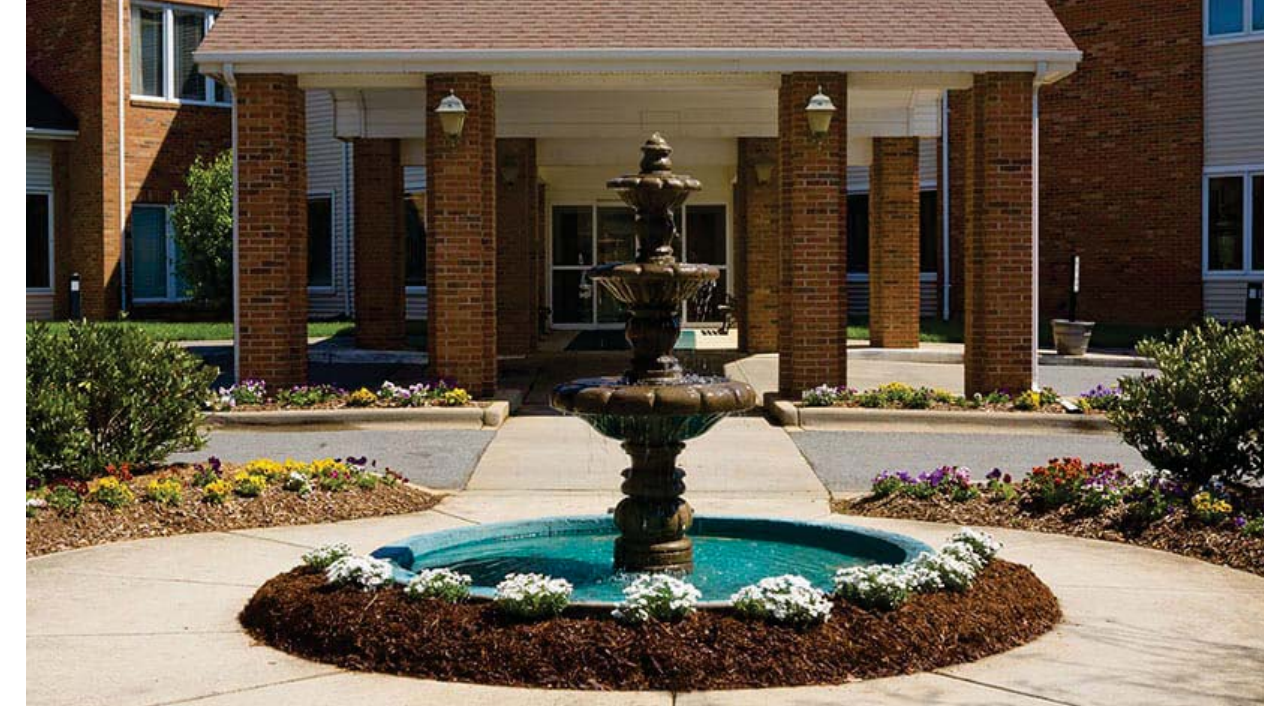
COMMUNITY CENTER ENTRANCE