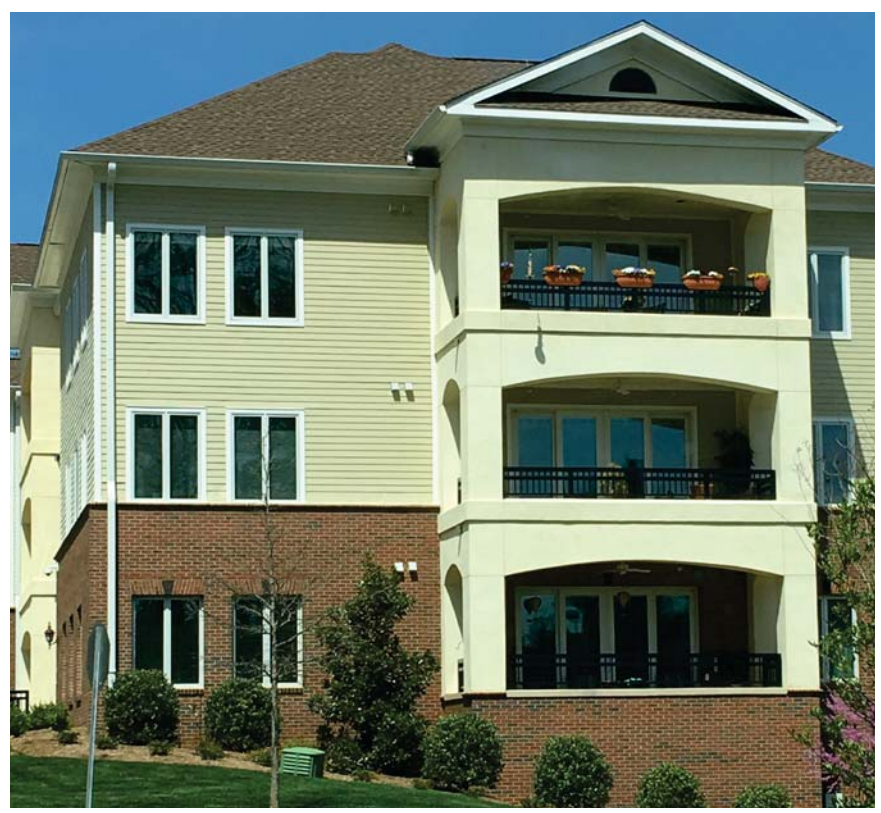
CURRENT HEALTH CARE BUILDING