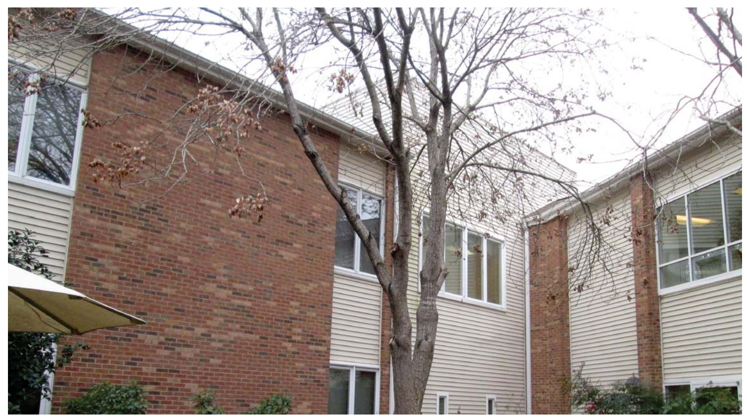
RESIDENT I.L. APARTMENTMENT BUILDINGS