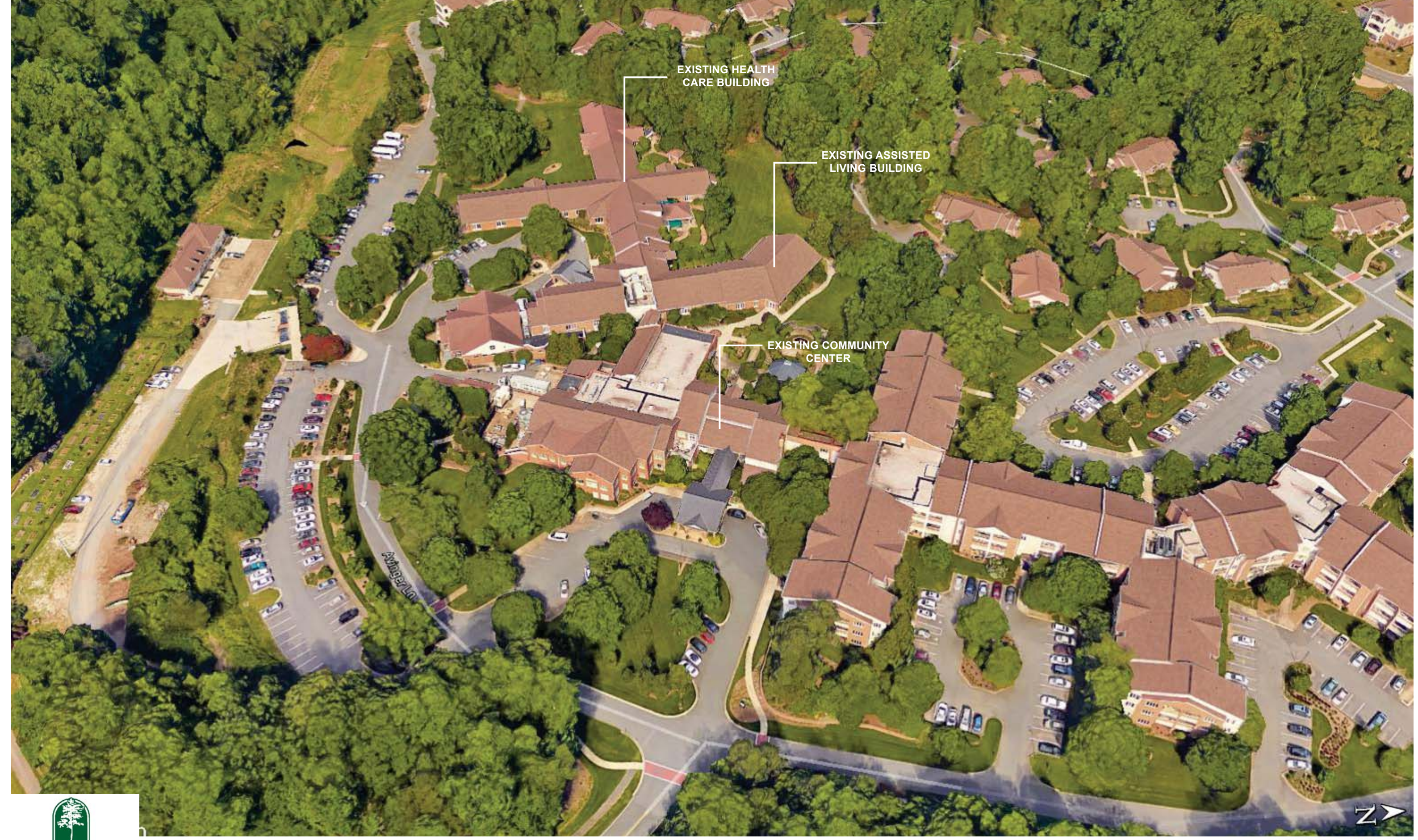
EXISTING AERIAL VIEW