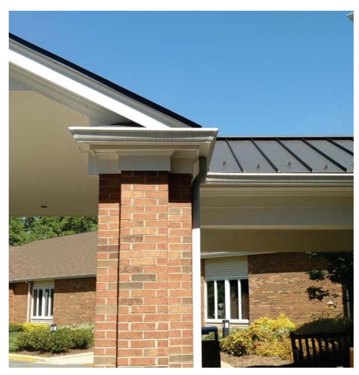
STANDING SEAM METAL ROOF AND BRICK COLUMN