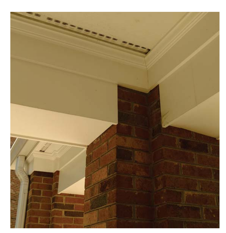
BRICK COLUMN AND SOFFIT AT PORTE COCHERE