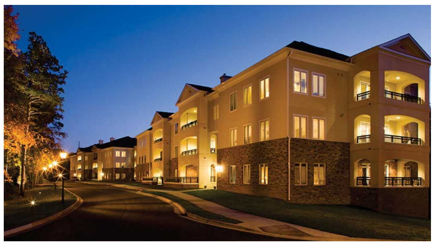
LAUREL RIDGE VILLA BUILDINGS