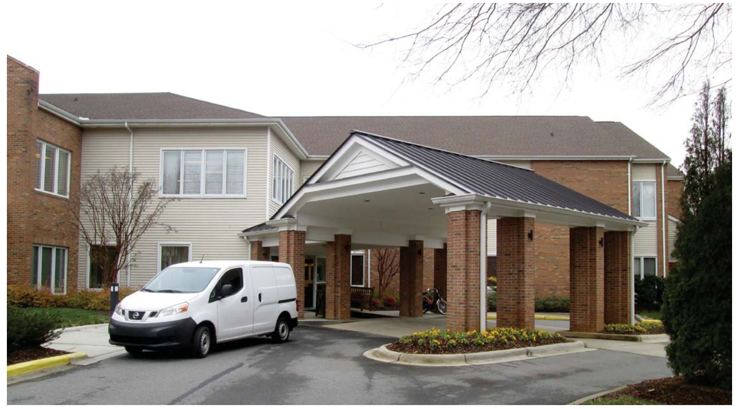
HEALTH CARE ENTRANCE AND ASSISTED LIVING