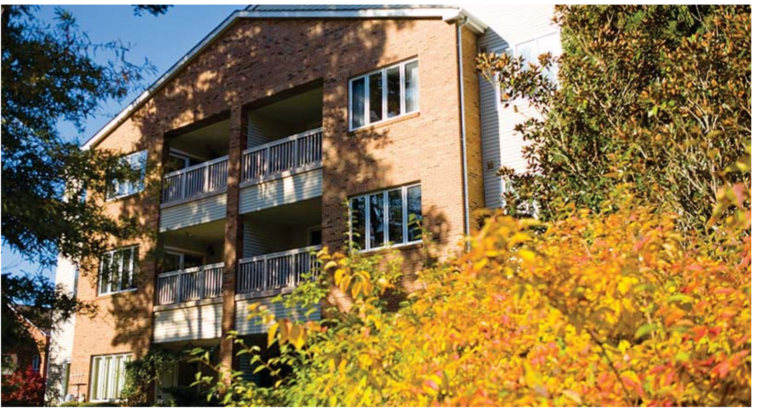
INDEPENDENT LIVING APARTMENTS