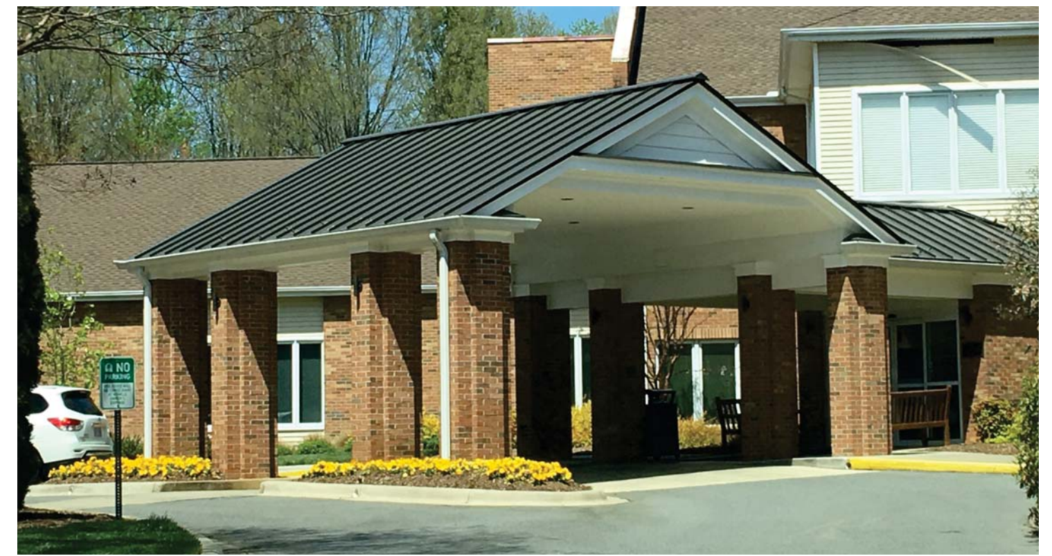
HEALTH CARE ENTRANCE