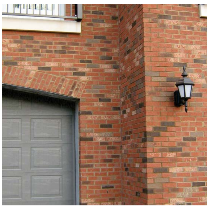
SOILDER COURSE AND BRICK DETAILS