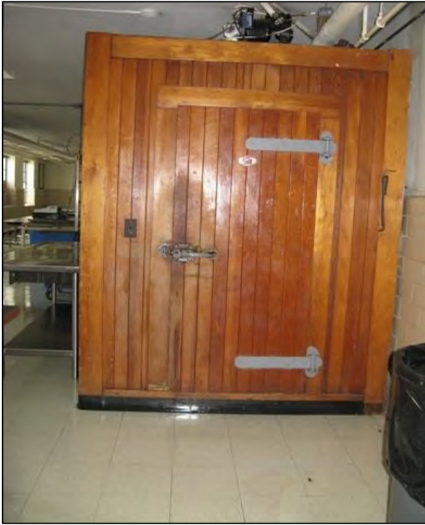
Original wood refrigerator