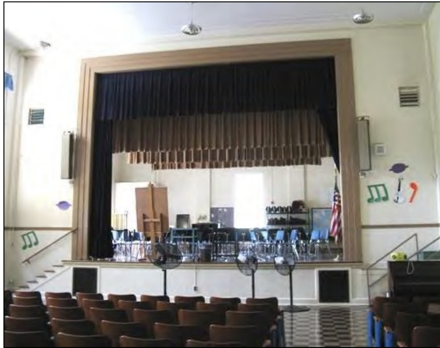
Stage area and proscenium