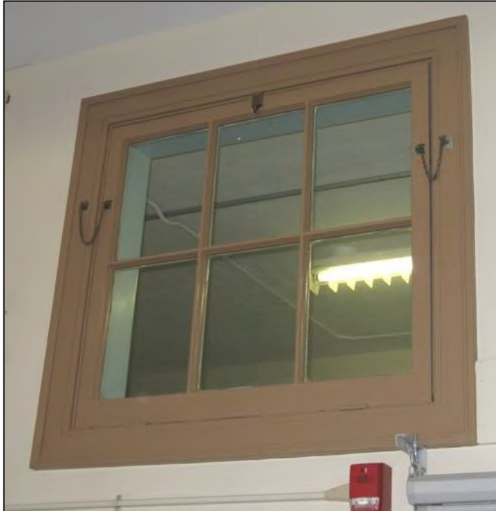
Corridor transom windows